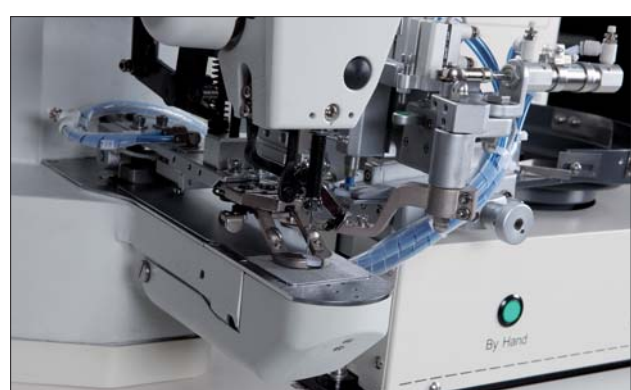
优良的夹扣结构系统 Excellent pick button up structure system