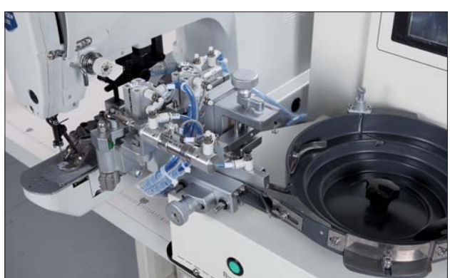
领先的自动送扣系统 Leading automatic button delivery system